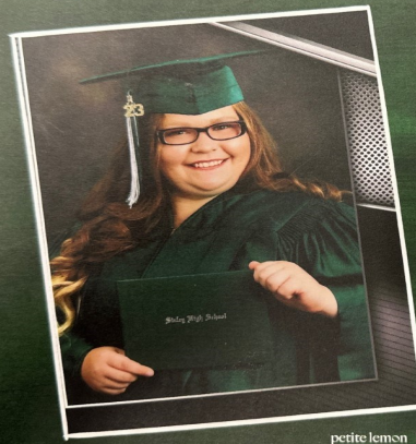
petite lemon Shutterfly exclusively for shutterfly.com